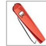
Folding Chair Bag (Folding Chair is Allowed)

FOR MORE INFORMATION GO TO PGATOUR.COM/ProhibitedItems