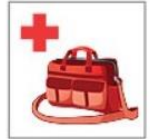
Medically Necessary and Diaper Bags*