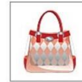
Printed Pattern Plastic Bag